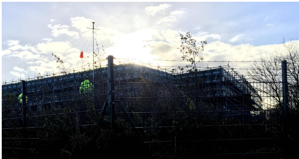
Frack Pad at Kirby Misperton

To access the Minerals and Waste Joint Plan Submission documents, and a range of supporting material, please visit the Examination website: www.northyorks.gov.uk/examination .