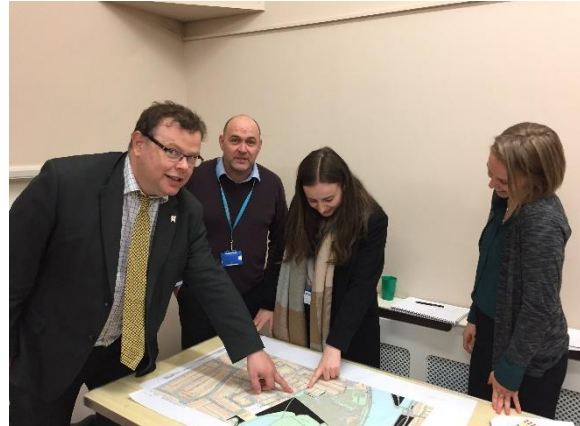
Clementhorpe Community Centre Environment Agency Public Drop in- and with Yorkshire Water

At my recent Executive Member Decision Session on 4 December, the topic of flooding preparedness was discussed and the Environment Agency presented their quarterly update of the Five Year Plan. A number of wards made representations at the meeting for flood defence and gulley cleaning. A formal request was made to the Environment Agency to review their proposed timetable for projects to speed up delivery of protection.