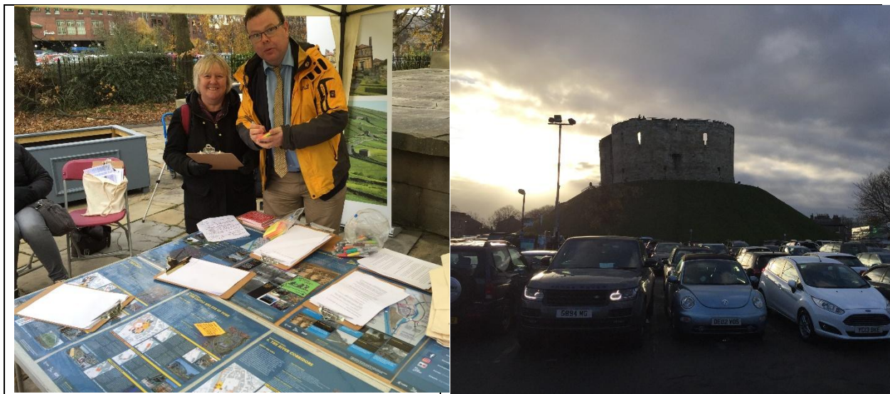
Public consultation on the future of Castle Gateway

Working with water is becoming a key theme of the development and links very strongly with the engagement on the Five Year Flood Plan for the city. I did attend some of the weekend engagement talks on the weekend of 25 th and 26 th November. I very much hope that many of the features for engagement can be applied to the York Central process going forward, in order to ensure a fully sustainable development which will work in harmony with the city.