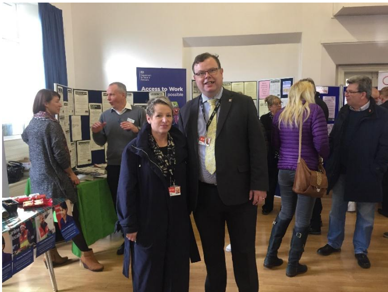
Jobs Fair at Acomb Parish Hall 15th November

I was delighted to attend the Acomb Jobs Fair on the 15 th November, an event that was well attended by members of the public, with over 200 people having attended the event by midday. 28 employers were in attendance to help support local communities with assistance with job searches, composing applications and accessing vital training. This had been organised with the support of York Learning and 4Community GrowthYork, the latter providing a range of services around communities in most need in the city and successfully applying for grant funding to enhance provision of support.